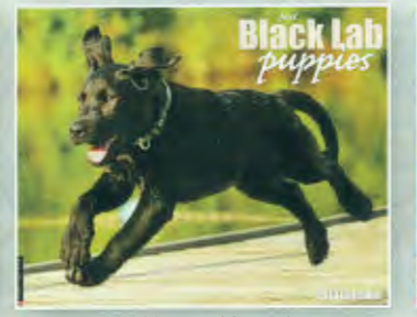
Product Code JL101