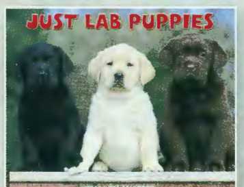
Product Code JL59