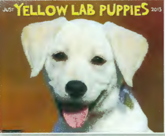
Product Code JL102