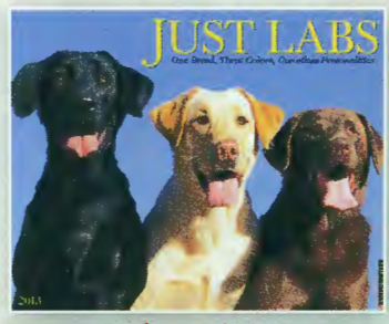
Product Code JL03

Three Ways to Order: Use the order form on page 46, call 800-447-7367, or visit www.justlabsmagazine.com and click "Store."